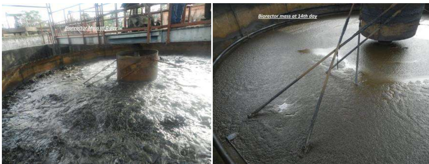
Bio-remediation facility of BGR

One old slurry thickener in ETP from Petrochemical section was converted to confined space bio-remediation reactor to treat oily sludge with help from IOCL-R&D. The process of bio-remediation started from July 2017. From 1 st April, 2023 to 30 th September, 2023 , 14.0 MT of oily sludge has been processed in the Bio-reactor.