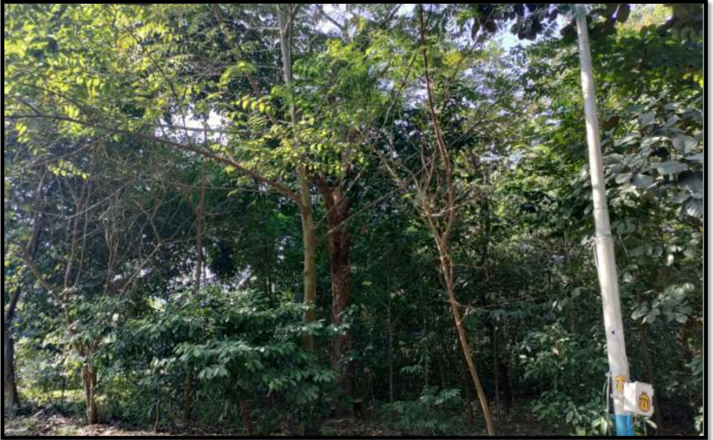
On WED'2020, 3740 nos. of sapling planted in BGR Township, Growth as on November,2023.