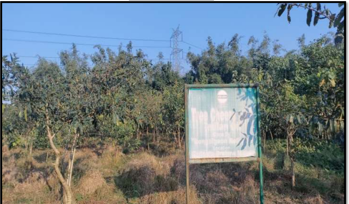
4810 nos of sapling Planted in the month of August'2020 at Hatipota Brahma Mandir, Growth as on October,2023.