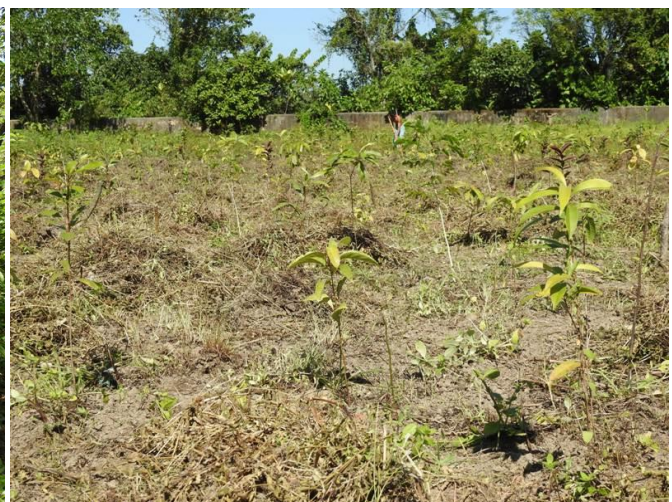
BIRHANGAON STATE DISPENSAR PLANTATION