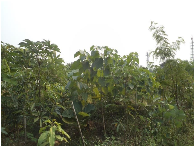
NEW GREEN BELT IN OLD DEBRIS YEARD

During, 1 st April 2017 to 30 th September 2017 BGR has planted 29400 nos. of trees.