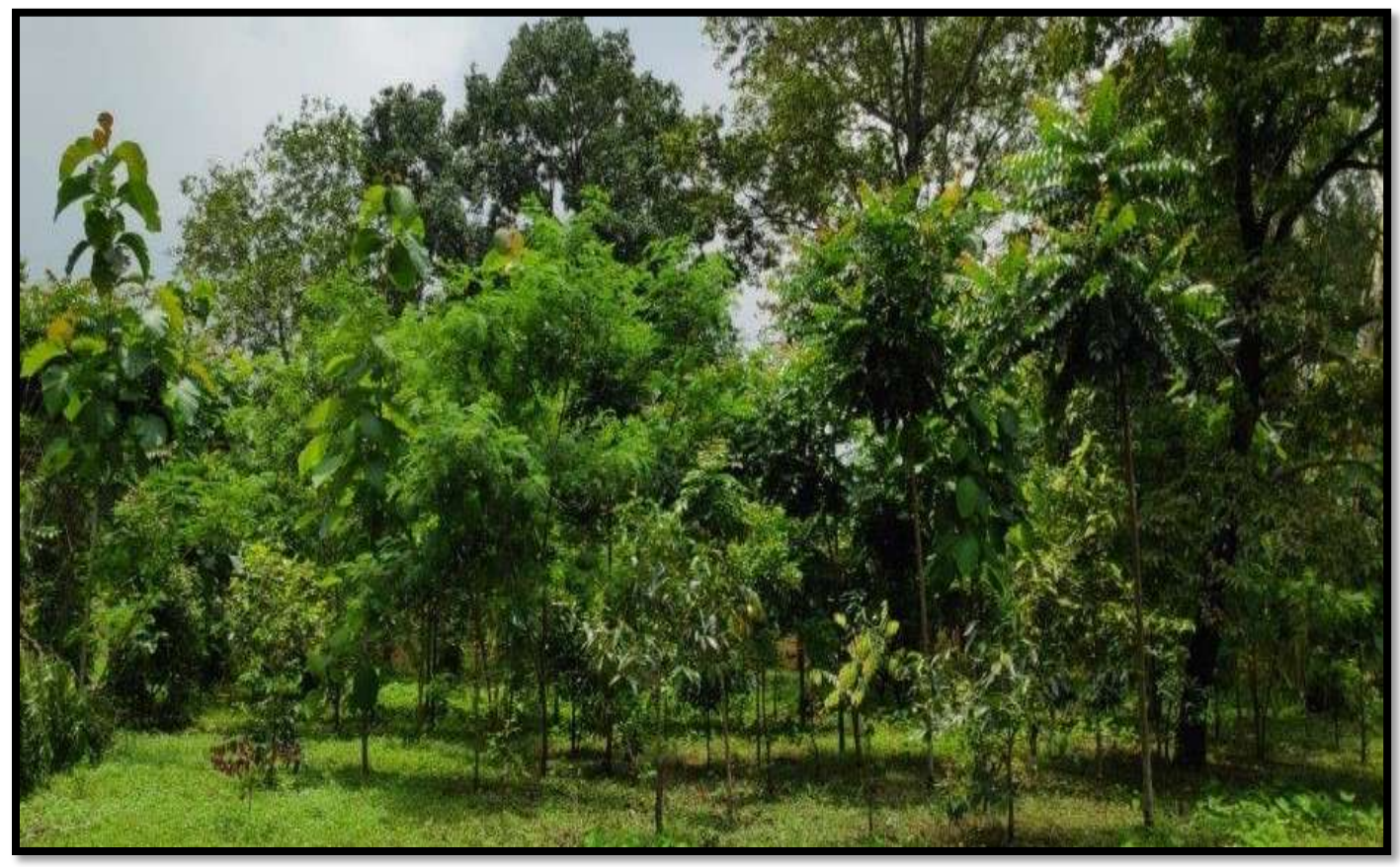
Tree Plantation 2018-19

BGR TOWNSHIP PLANTATION, Planted Van mahotsav 2018, Growth as on April, 2020