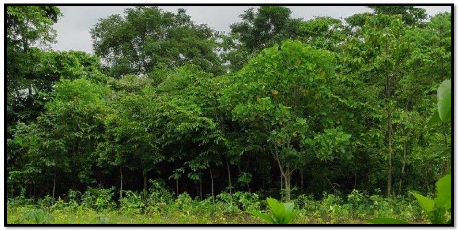
Birhangaon State Dispensary Plantation, 10,000 nos. Sapling Planted by Miyawaki Method in the month of August,2017. Grouth as on April, 2020