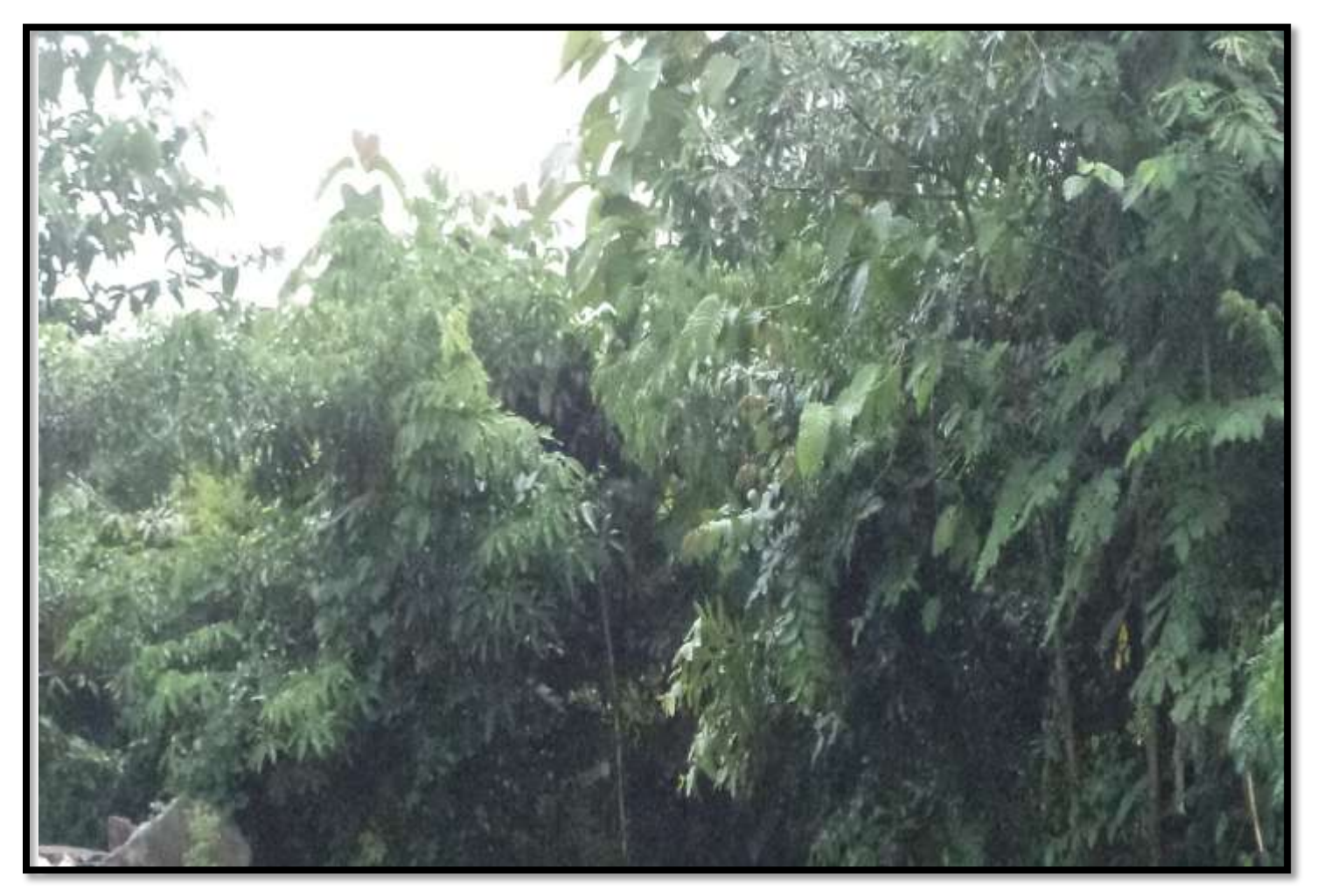
COMPLEX OLD DEBRIS YARD DEVELOPED INTO GREEN BELT. Planted in July'17, GROWTH as on Dec'2020