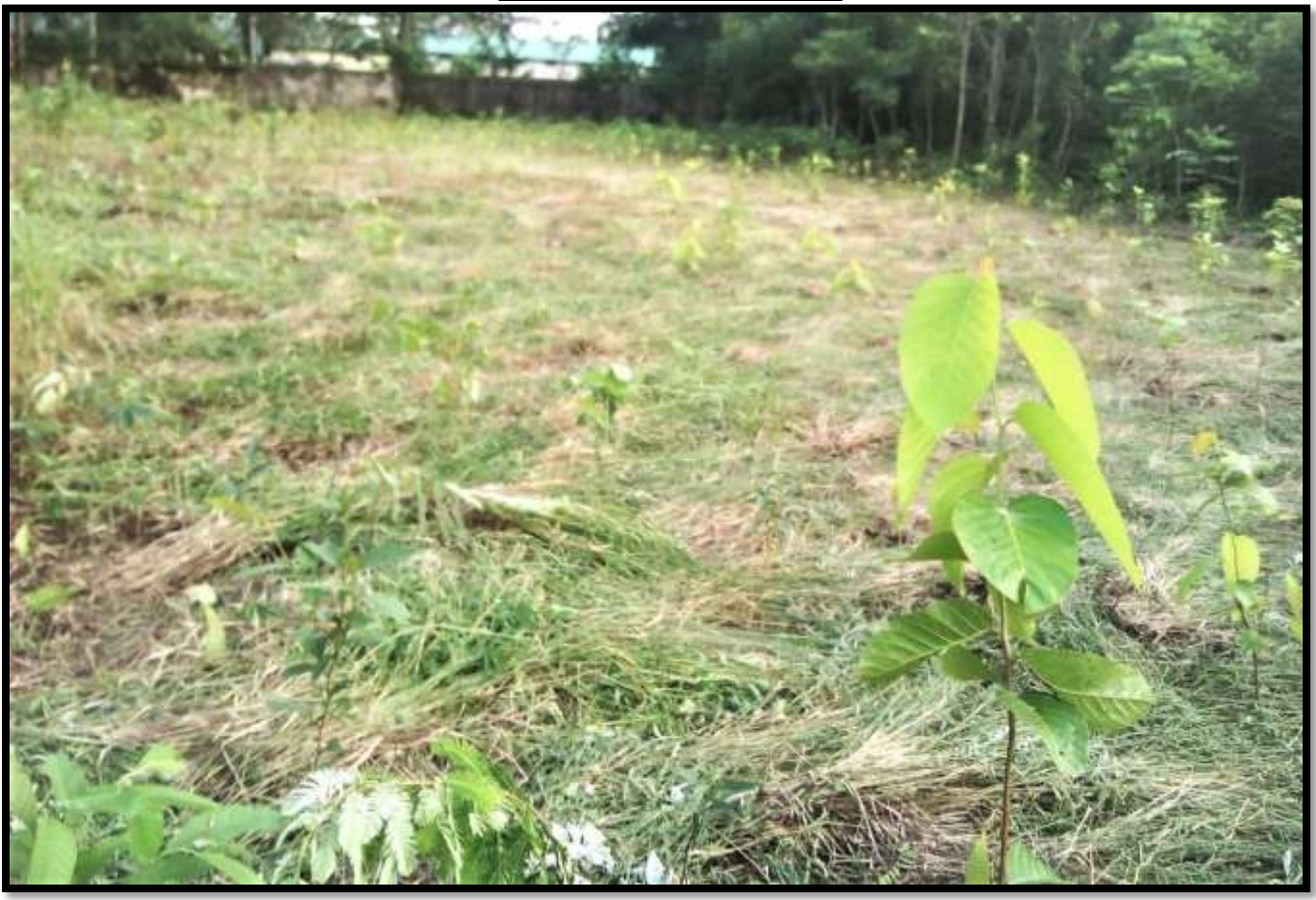
Birhangaon State Dispensary Plantation, 5375 nos. Sapling Planted by Miyawaki Method in the month of September,2019. Grouth as on April, 2020