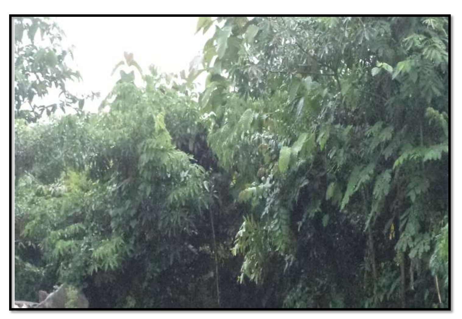
COMPLEX OLD DEBRIS YARD DEVELOPED INTO GREEN BELT. Planted in July'17, GROWTH as on Dec'2019