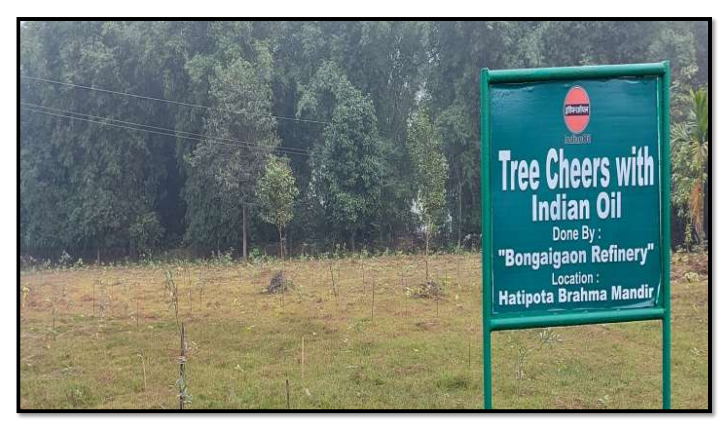
4810 nos of sapling Planted in the month of August'2020 at Hatipota Brahma Mandir.