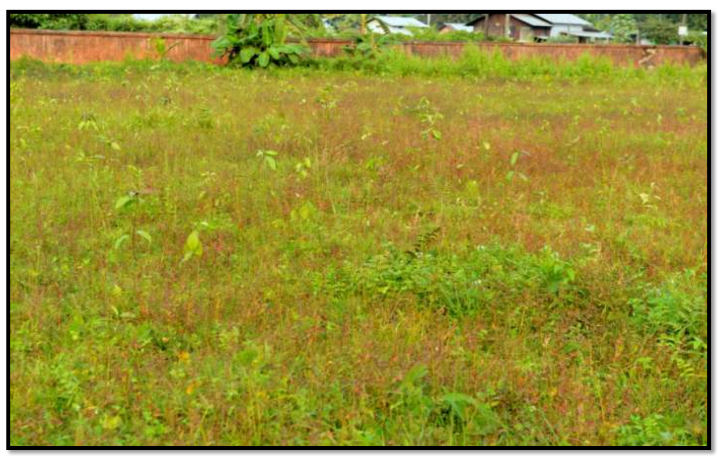
5500 nos of sapling planted at Bengtol Community Health Centre in August'2020