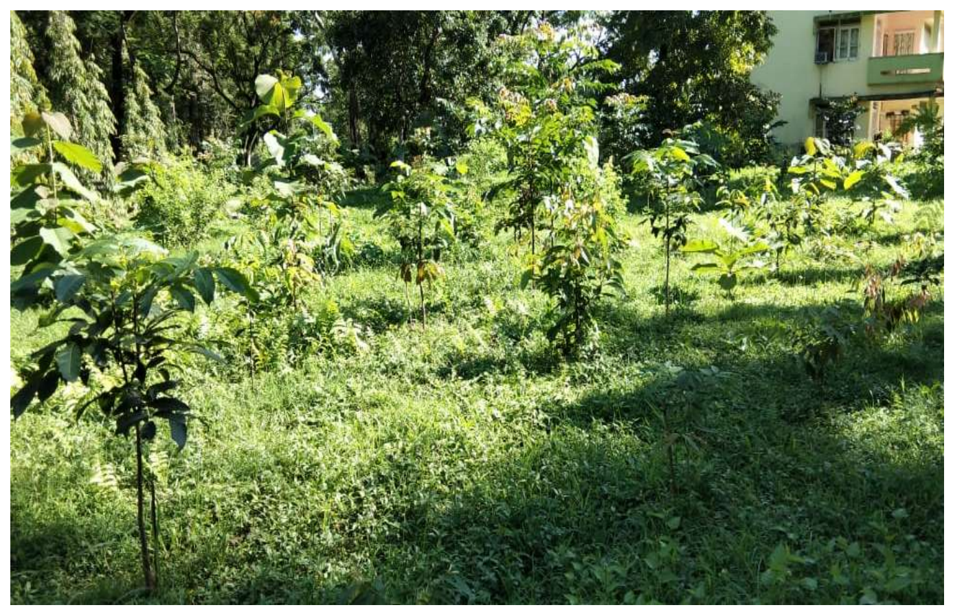
BGR TOWNSHIP PLANTATION, Planted Van mahotsav 2018, Growth as on 15.06.19