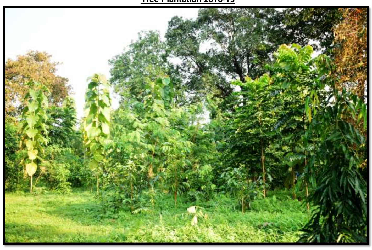
BGR TOWNSHIP PLANTATION, Planted Van mahotsav 2018, Growth as on 04.10.19