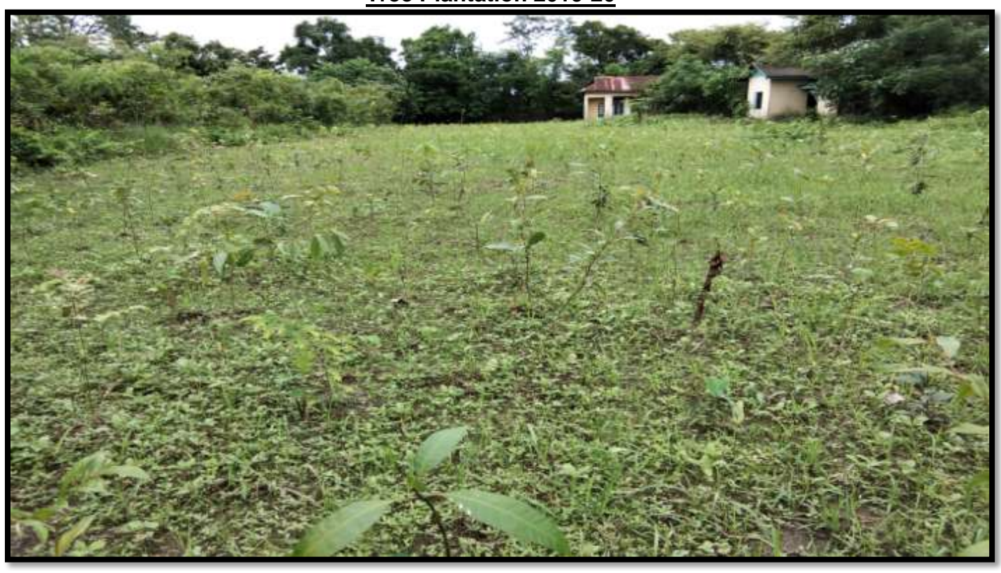
<u>Birhangaon State Dispensary Plantation, 5375 nos. Sapling Planted by Miyawaki Method in the month of September, 2019.</u>