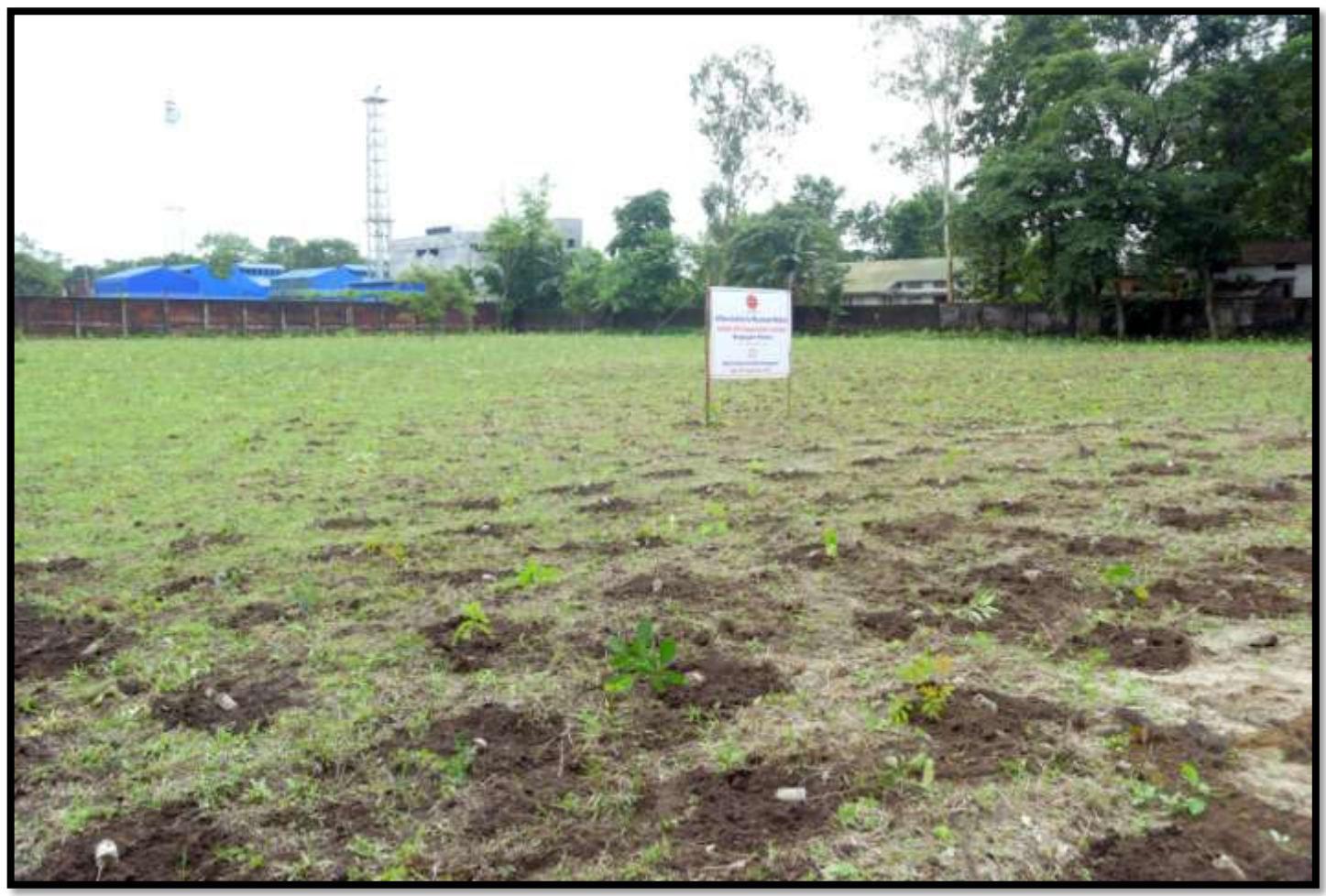
North Bongaigaon High School, 5250 Sapling Planted by Miyawaki Method in the month of September, 2019